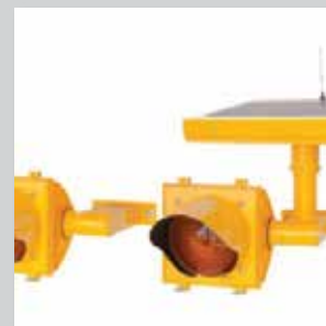
Construction Site Beacons