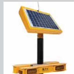
Stop Sign Beacons